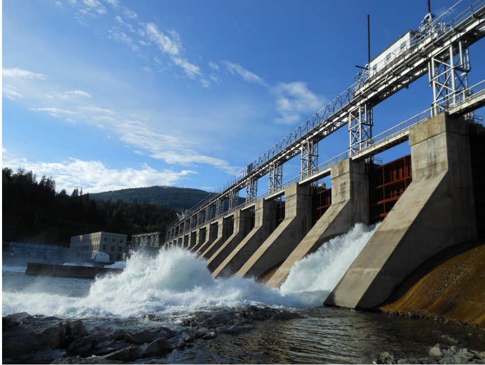
Photograph of Kootenay River free-fall discharge through Corra Linn Dam during the Spring high-water period