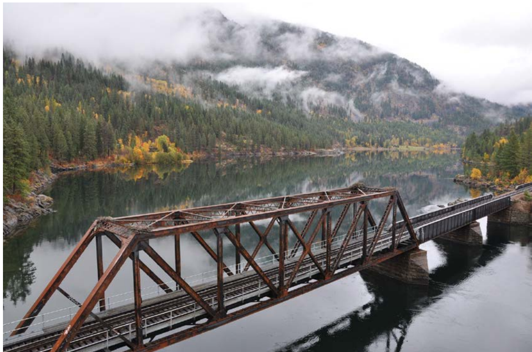
Photograph of rail bridge over the Kootenay River during the Fall low-flow period. This location is upstream of Corra Linn Dam, about mid-way between the dam and the city of Nelson BC and Corra Linn Dam. Photo: October 20, 2017.

This Annual Report covers the operations of Corra Linn Dam by the Applicant to the IJC Order (FortisBC) and the associated effects on the water level of Kootenay Lake in 2017. FortisBC operates Corra Linn Dam on the Kootenay River approximately 22 kilometers upstream from its confluence with the Columbia River, and downstream from the West Arm of Kootenay Lake. FortisBC controls discharge through and around Corra Linn Dam in accordance with requirements of the Order of the International Joint Commission dated November 11, 1938. FortisBC co-operates with BC Hydro, which also manages a hydro-electric generating facility (the Kootenay Canal Project) which is hydraulically connected to the Corra Linn dam forebay on the Kootenay River through a constructed canal.