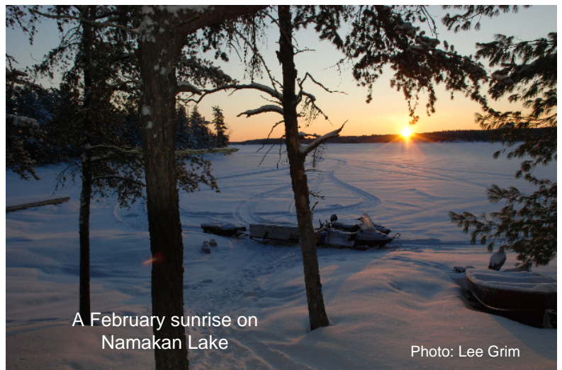
A February sunrise on Namakan Lake