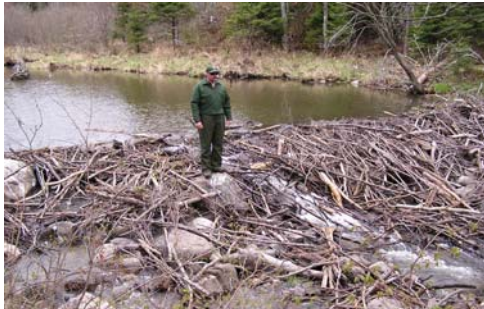
USGS staff monitors the beaver dam at Gold Portage.

Rising lake levels, resulting from precipitation received during May, led to the overtopping and eventual breach of a beaver dam blocking Gold Portage. At the end of May, the USGS recorded a flow of 574 cfs (16.25 cms) through the breached dam.